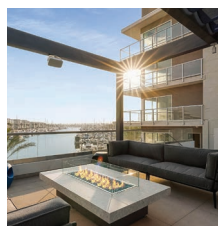
Residence Inn by Marriott