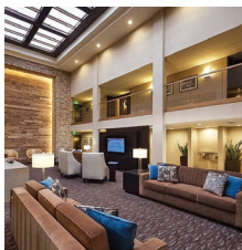
Hilton Garden Inn