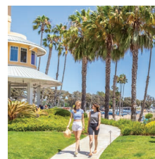
Jamaica Bay Inn