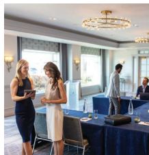
The Ritz-Carlton, Marina del Rey