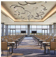
Marina del Rey Marriott